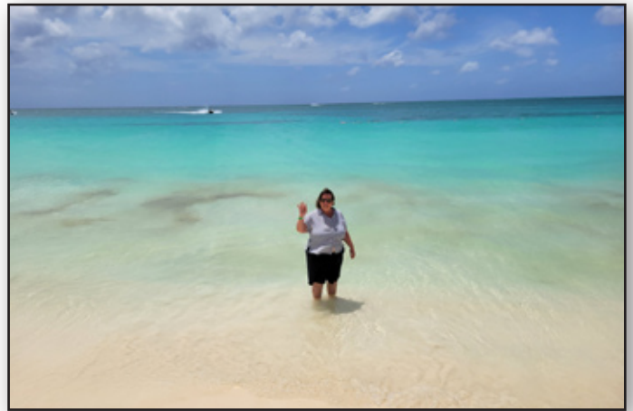
This was the best picture of our entire trip. My beautiful wife on the beautiful sandy beach of Aruba. We were able also to hand out a couple of gospel silver dollars here and on board.