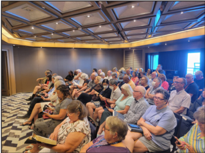
This was a church service on a Sunday morning onboard ship. About 75 filled this room to sing praises, read the word, and hear a sermon on the "Holiness of God." This special assembly was the best part of our trip.