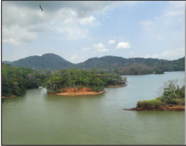
A hundred years ago this was a swampy Malaria infested marshland. Now a beautiful lake between the locks of the Atlantic and Pacific ocean to be enjoyed from the dining room aboard ship.