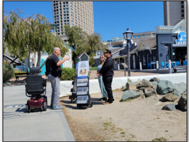
This photo was taken at Seaport Village this past month. The gentleman was a long time Jehovah Witness. I shared with him many serious errors of the organization. I was shocked that he let me lead the conversation with no resistance. As if he were absorbing all I had to say and perhaps even agreeing. This was one of those rare opportunities where he actually took a tract with my name on it. Perhaps God will save him and his wife.

What a privilege to share Christ where ever we go.